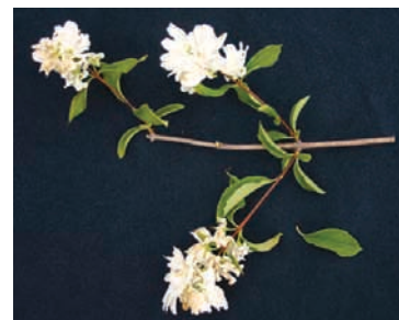
Philadelphus lewisii Wild Mock Orange. Hydrangea Family (Hydrangeaceae)

immersed in water, baskets made from deergrass stalks would expand until they became watertight, making them ideal for water jugs and cooking baskets. They were used to form the foundation of coiled baskets made by tribes such as the Cahuilla and Mono. A Mono cooking basket could require around 3,750 flowering stalks, or the yield of at least three dozen large deergrass plants. California native basket weavers carefully managed large stands of deergrass in order to produce the most ideal material for creating beautiful and useful baskets. Deergrass stands were groomed, pruned, trimmed, and weeded to produce long, straight stalks with no side branches. Also important, grassland areas were carefully burned by tribes such as the Foothill Yokuts, Luiseño, Kumeyaay, and Mono, every two to five years in order to clear out dead material, eliminate insect pests, recycle plant nutrients, and thin other competitive shrubs that blocked the sunlight. Today, as a result of cattle ranching, agriculture, fire regulations, and an increase in invasive grass species, the habitat for deergrass has been compromised and the natural populations are thus limited and difficult to find. Sadly, this means that the continuation of the weaving tradition, and the vast cultural and ecological knowledge associated with it, is increasingly difficult to maintain, for without a large amount of raw materials, the baskets cannot be made.