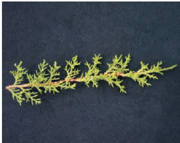
Juniperus californica . Juniper, Hireeni, Xirren. Cypress Family (Cupressaceae)

for respiratory, skin, urinary, and digestive ailments such as asthma, bronchitis, kidney problems, bladder infections, poison oak inflammations, and general cuts, sores, and swellings. Gumplant is useful as an antispasmodic and expectorant because it relaxes bronchial passages, clears mucus, and desensitizes the bronchial nerve endings, making breathing easier. The Shoshone and the Blackfeet Indians of California used gumplant as a remedy for colds, making a medicinal tea from the leaves and especially the sticky flowers. Gumplant was also popular in California Indian medicine as treatment for poison oak inflammations because it increases surface blood supply to skin tissues and contains antimicrobial agents, thus stimulating the healing of tissue and the easing of inflammation. Gumplant is still used today as a modern remedy for poison oak; it is the main “itch relieving” ingredient in “Tecnu Extreme”, a mainstream skin product manufactured as a wash for poison oak and ivy.