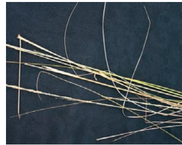
Mulhenbergia rigens Deergrass. Grass Family (Poaceae)

Junipers are resinous, aromatic plants, and have been used to ward off bad spirits and sickness in cultures all over the world. The leaves and branches are burned as a smudge stick, and the berries are thrown on hot rocks, in a fire or in a sauna to be used as incense. California Indian groups used the berries, leaves, and bark in teas to treat colds, coughs, flu, fever, high blood pressure, and constipation. The Kumeyaay Indians made juniper tea to stop hiccups. The inner bark of the juniper was used to make diapers, clothing, sanitary napkins, and mattresses, and the Paiute Indians harvested the wood to shape their bows. The berries were eaten as a medicine for colds and were also useful nutritionally during food shortages, especially in the lean winter months. The Mutsun people of the central California coast called the junipers hireeni and their neighbors the Rumsen called them xirren. Today juniper berries are used commercially to flavor gin and other liquors, and they are also added as a spice to foods such as meats, fish, and sauerkraut.