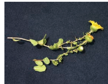
Grindelia spp. Gumplant. Sunflower Family (Asteraceae)

plant. Flannelbush is found on north facing slopes in the chaparral up to 6000 feet, in rocky canyons and in oak and pine woodlands in California, Baja California and Arizona. The inner bark of the flannelbush is anti-inflammatory and contains mucus that coats, soothes, and protects body surfaces, making it useful externally as a poultice on sores and internally to soothe sore throats and ulcerous stomachs. The Kawaiisu used the inner bark of flannelbush to relieve sore throats and also as a laxative. California Indian tribes such as the Mono, Yokut, Washoe, Paiute, and others used the flexible wood of the flannelbush to create animal traps and snares, harpoons and spears, cordage, and hoops for the popular hoop-and-pole game. They managed the length and form of flannelbush shoots by pruning, and burning. Pruning and burning encouraged strong, new growth and allowed California Indians to control the quality of the materials they used.