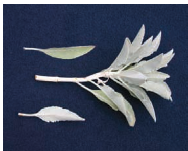
Salvia apiana White Sage. Mint Family (Lamiaceae)

Some species of Ribes , such as R. aureum , or the golden currant, and R. malvaceum , the chaparral currant, were especially prized as a tasty treat, while others, such as R. cereum , or bear currant, were edible but were mostly used as an emetic to induce vomiting. Pemmican was made by pounding ground meat, fat, and dried Ribes berries together, and it was considered a staple of the California Indian diet. Members of the Ribes genus were also used medicinally. The Paiute and Shoshone Indians used the inner bark of R. aureum as a poultice on sores and swelling. The Paiute used the powdered bark on sores and would chew on a piece of the root to ease sore throats. Currants and gooseberries can still be found in the California landscape today, and many contain high levels of vitamin C, phosphorus, and iron. Today you can find currant or gooseberry products in stores, though they may be from European varieties. Currants have been used by people worldwide to make jams, beverages, and dried fruit, though a majority of these are from the “currants” that are dried from currant-sized, small grapes.