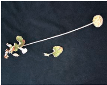
Eriogonum latifolium Coast Buckwheat. Buckwheat Family (Polygonaceae)

California Indians used as a sedative for nervousness, insomnia, and hysteria, and stems were placed in a baby's bed to promote calming and to relieve illness. A moist, soft poultice of the plant was also applied to a newborn's navel to prevent infection. A tea made from the leaves was used as a wash for sores and a tea made from the roots was drunk for indigestion, colds and constipation. Although some California Indians used this plant internally, today it is not recommended to take the plant internally due to possible mutagenic effects.