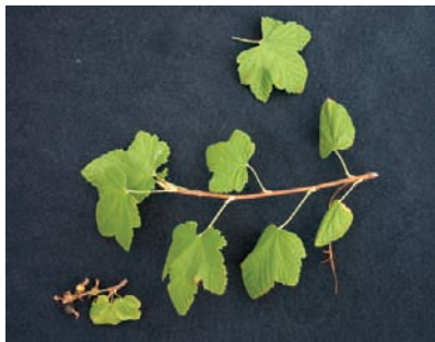
Ribes spp. Currant, Gooseberry. Gooseberry Family (Grossulariaceae)

There are thirty species of currants and gooseberries recognized in California; all have leaves that resemble a maple leaf with rounded points, and all have small red to purple berries that are considered edible. California Indians used berries from many members of the Ribes genus to make jellies, preserves, beverages, and dried fruit snacks.