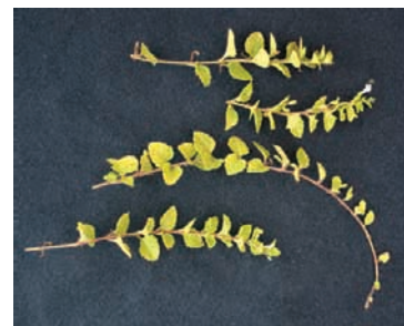
Satureja douglasii Yerba Buena. Mint Family (Lamiaceae)

tooth aches, colds, flu, asthma, to promote menstruation, and to cleanse skin wounds and rashes. The Luiseno and Cahuilla Indians used white sage as a shampoo and deodorant, making a shampoo by rubbing fresh leaves between the palms with water. It is also said that smoking white sage can induce sacred dreams and help people recovering from addiction, due to the calming effects of the smoke and the good spirits it is said to attract.