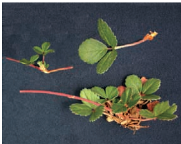
Fragaria chiloensis Coast Strawberry, Beach Strawberry. Rose Family (Rosaceae)

for colds and coughs. California Indian groups used coast buckwheat for stomach pains, menstrual disorders and headaches. The Sanpoil used a root decoction (boiled into water and made into tea) for diarrhea, and the whole plant was used in steam baths to ease pain resulting from rheumatism and aching joints. Various species of buckwheat found in California were used as food. The small seeds were ground and eaten raw, mixed in porridge and cakes, and dried for future use. The new leaves and stems of some species of buckwheat were also eaten as a green, either cooked or raw. Other members of the buckwheat family, such as common buckwheat or Fagopyrum esculentum , are important food crops today. Flour made from the seeds of common buckwheat is used in foods ranging from Japanese soba to buckwheat pancakes. Since buckwheat is gluten-free, it may be an important alternative grain for those with an allergy to wheat or gluten. Many species of Eriogonum in California are common and some may be rare and/or endangered. Eriogonum crocatum and Eriogonum grande var. rubescens are listed as fairly endangered in California.