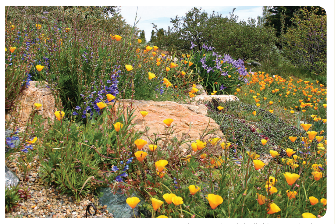
Spring is a good time to explore a little off of the main trail in the entrance natives garden to see California rock garden plants.