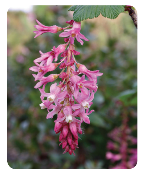
Gooseberries and currants in the genus Ribes flower well in the spring. Anywhere but the coast, they will probably do better with at least some light shade.