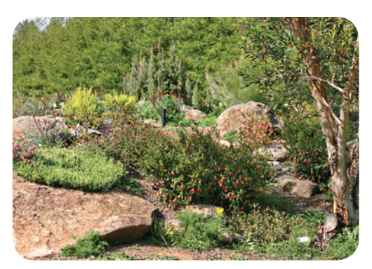
As parts of the Australian Rock Garden get finished, plants are assuming natural contours growing over the boulders.