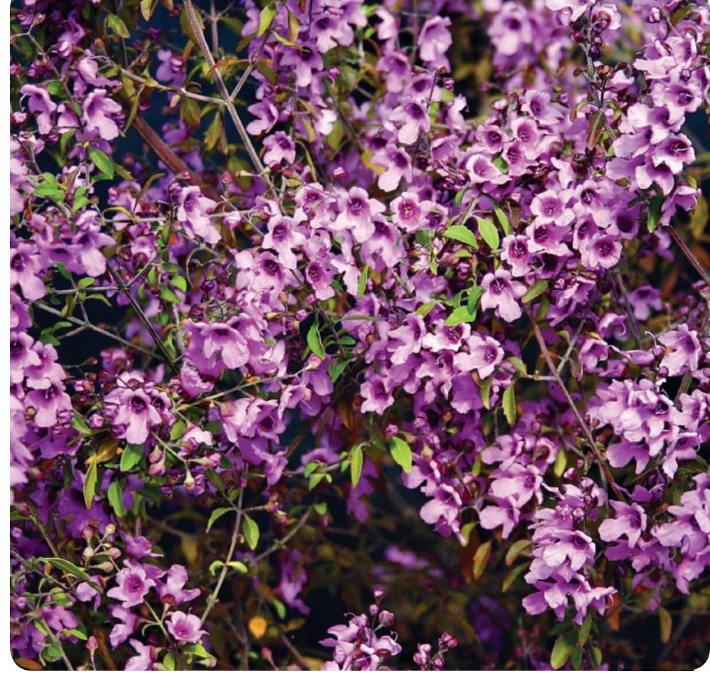
Even Prostanthera ovalifolia 'Purple Haze' plants that haven't been tip pruned produce a good show of flowers in the spring. Many prostantheras will be available at the Spring Sale and gift shop.

m 4 Winter/Spring 2010 \cdot Volume 33 \cdot Number 4 arphi Volume 34 \cdot Number 1