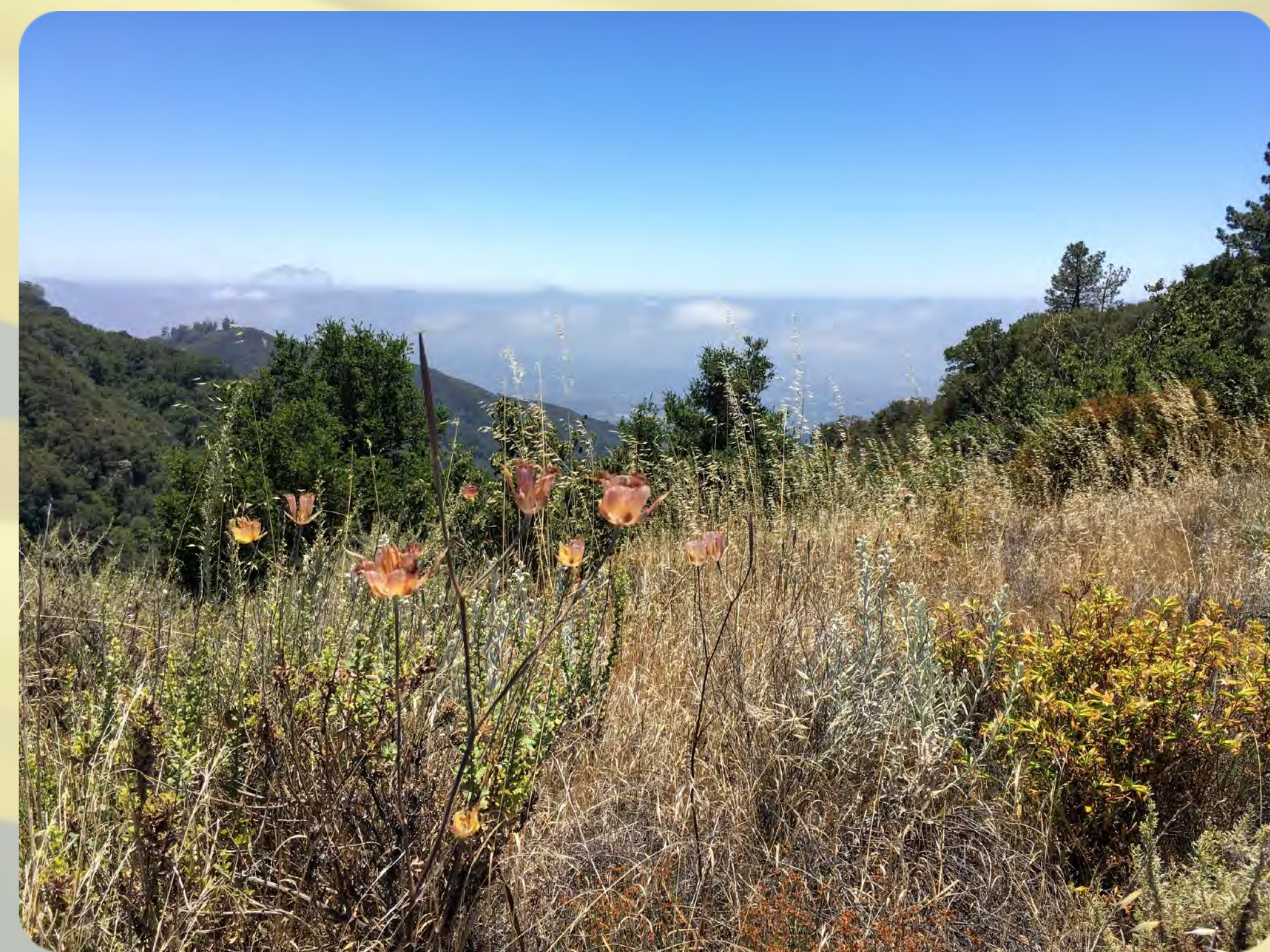
Calochortus fimbriatus (late flowered mariposa lily) CRPR 1B.3

Our long-term goal is to secure all of the California flora in seed banks or living collections. Our near-term goal is to conserve 75% of the rare and threatened species of California in established and secure regional conservation collections by 2020.