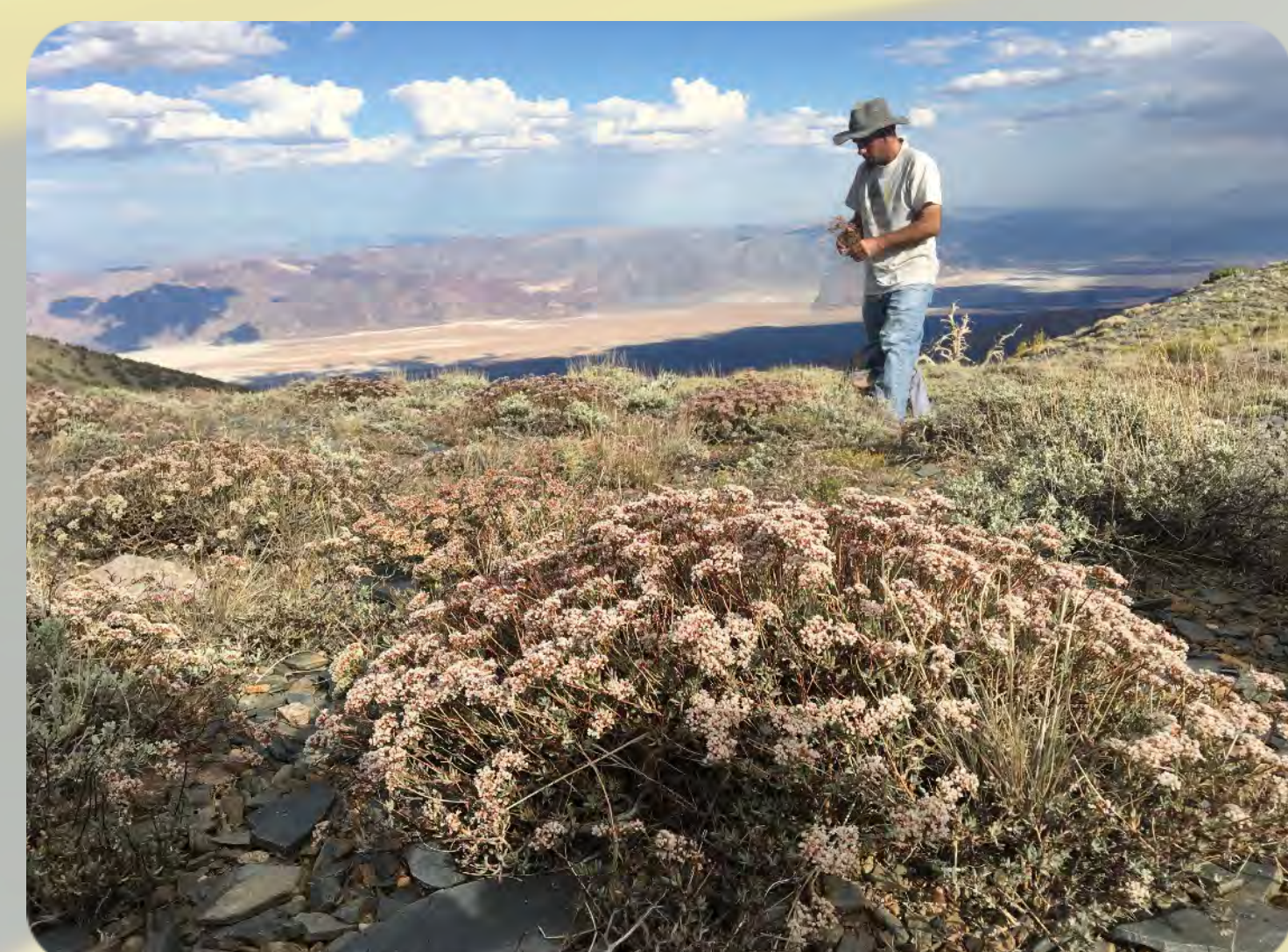
Duncan Bell collecting seeds of Eriogonum microthecum var. panamintense (Panamint Mountains Buckwheat; CRPR 1B.3) in Death Valley National Park