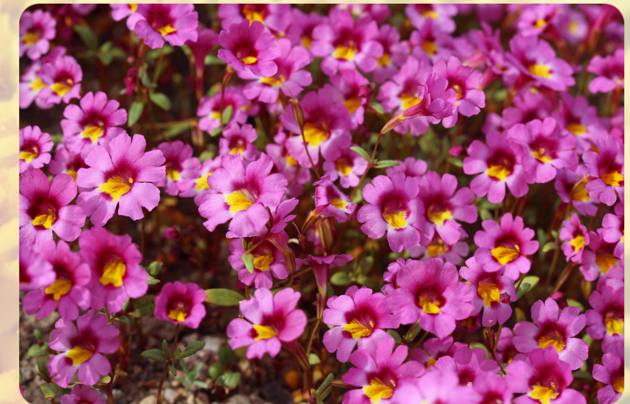
Erythranthe rhodopetra (Red Rock monkeyflower) CRPR 1B.1

Our progress towards rescuing the botanical diversity of California and Baja California is not measurable in species and plant taxa alone. We have also been working to build our membership and degree of collaboration by adding capacity to individual institutions. Our joint funding efforts have rewarded us with a Section 6 Recovery Grant through California Department of Fish and Wildlife and the U.S. Fish and Wildlife Service. We have built a database to better communicate our collection progress and changing priorities and targets. All of this helps us to work efficiently to conserve California's plants.