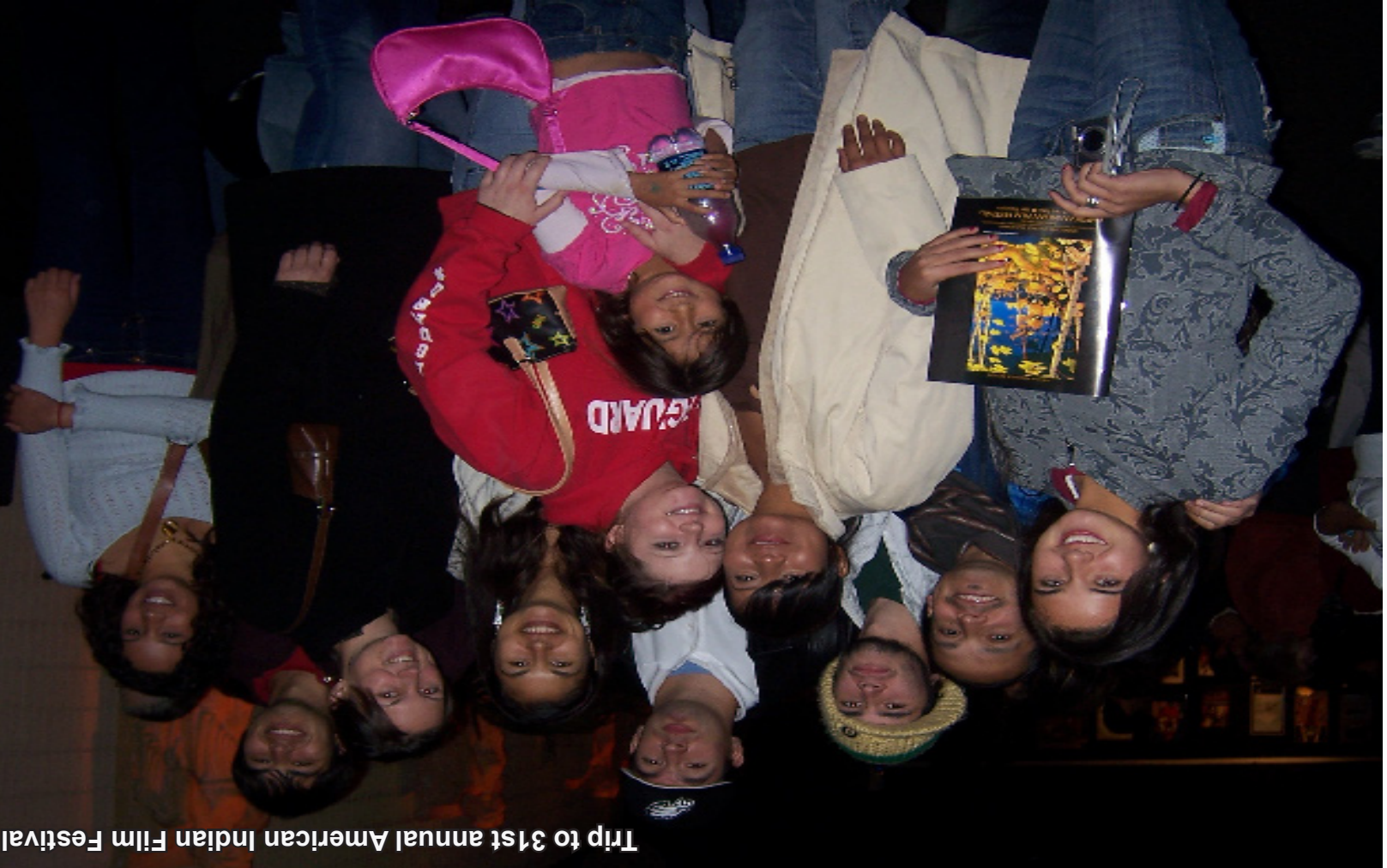
Trip to 31st annual American Indian Film Festival